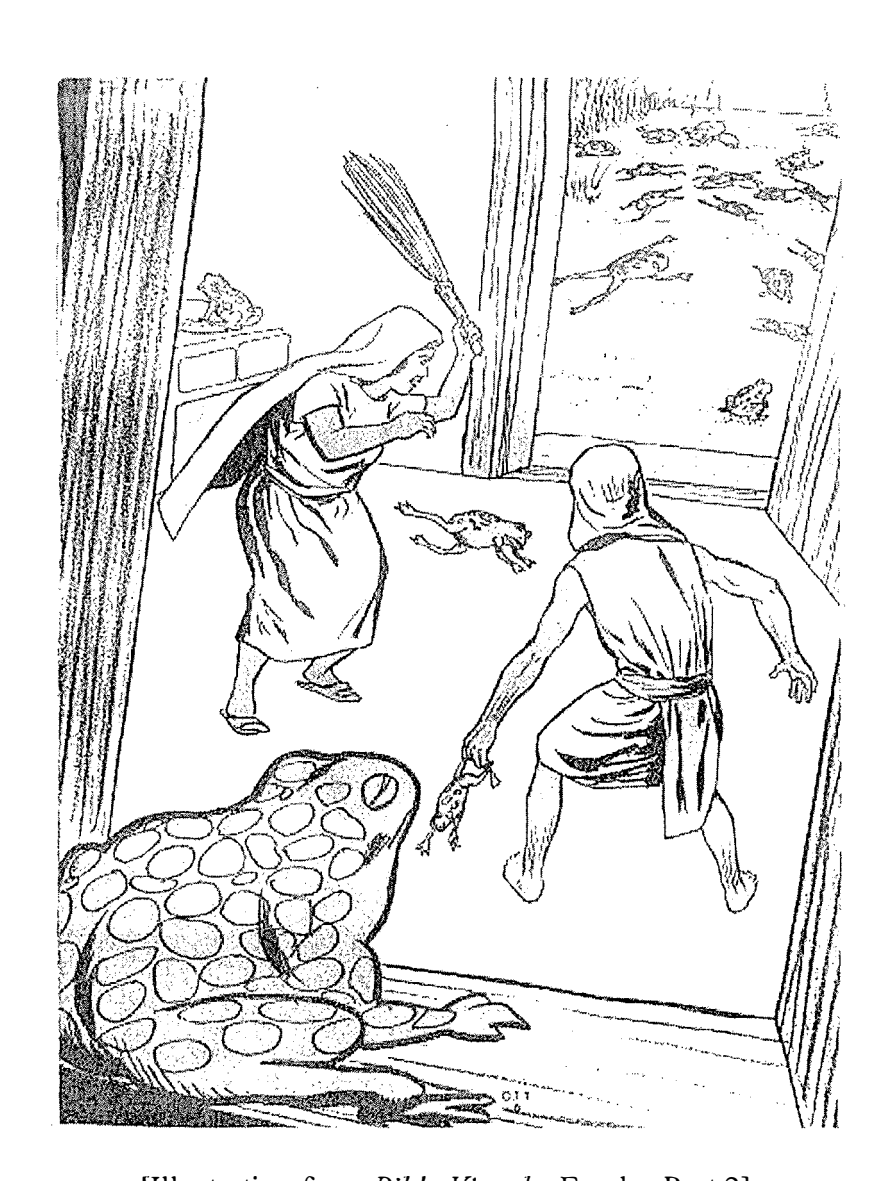
[Illustration from Bible Visuals , Exodus Part 2]

This plague of frogs happened exactly as the Bible describes it. The Egyptians were plagued by frogs in enormous numbers, to the point where these amphibians were found in their bedrooms, in their ovens, etc. Why do we believe this? Because the text of the Bible says so! The text of Scripture is very clear about this plague and we take these statements literally. This plague really happened, just as described in the book of Exodus.